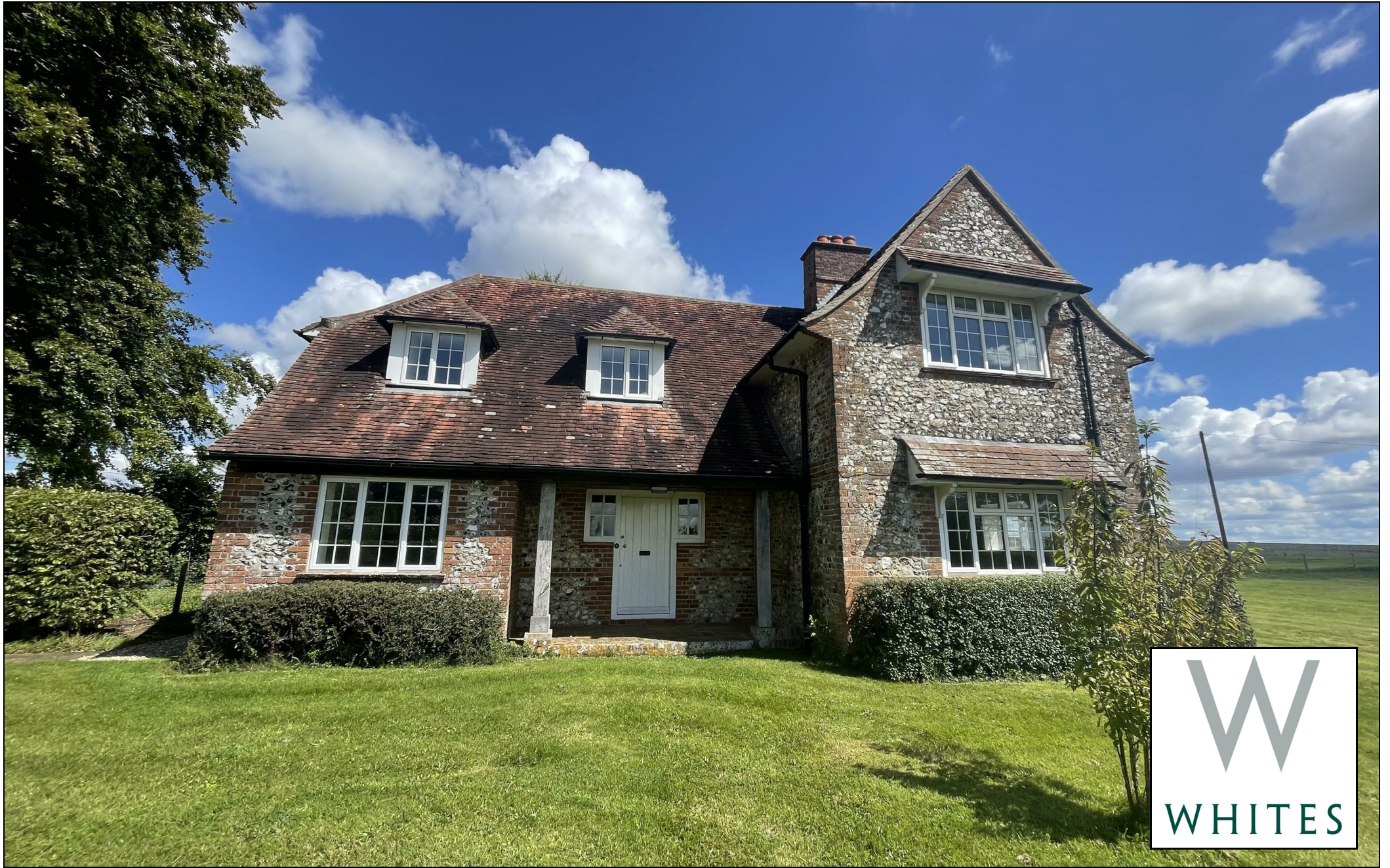
Bailiffs Cottage West Woodyates, Salisbury, SP5 5QS